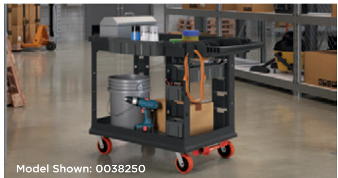
Model Shown: 0038250